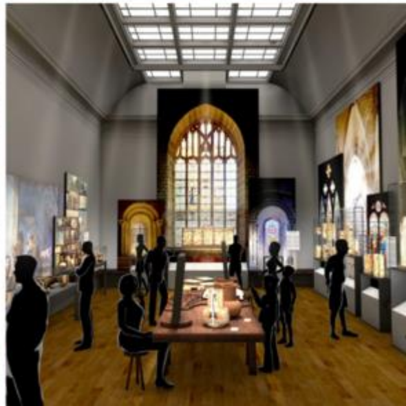
Visuals for the (Top L-R) Rebellion Gallery, (Left) lace gallery, (Right) Alabaster gallery