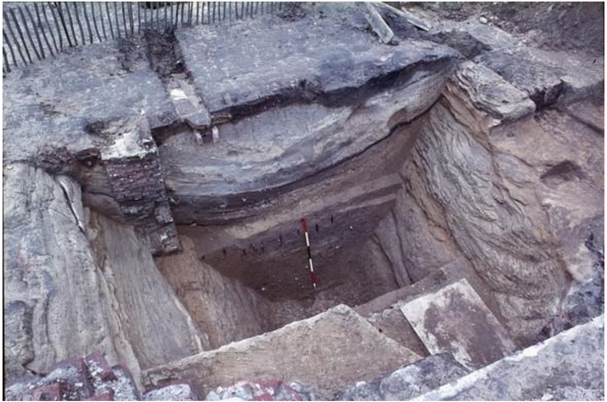
The pre Norman Conquest ditch as excavated at Drury Hill in 1970

950 years ago Nottingham was a large settlement by medieval standards but only occupied the area we know today as the Lace Market. The Lace Market, positioned on raised land, offered a strategic vantage point of the Trent Valley and so appealed to the founders of Nottingham in the same way as the castle rock appealed to William the Conqueror."