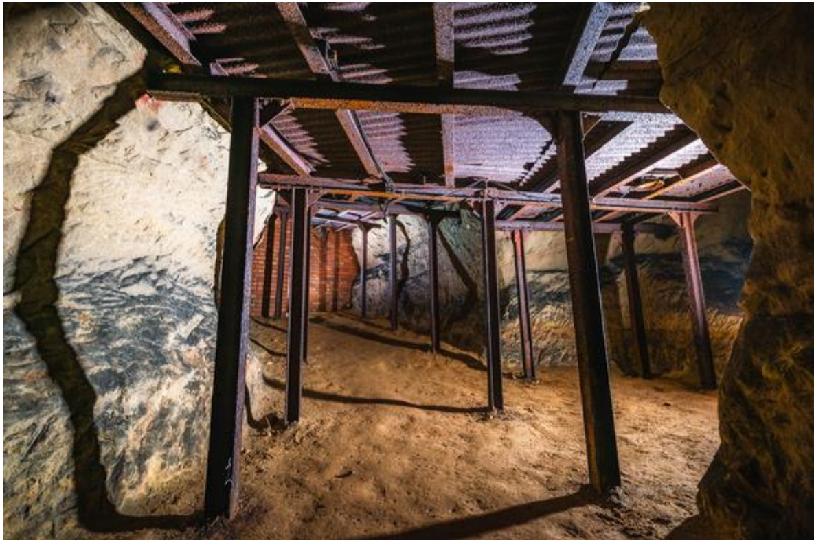
A Lamar Francois photo of the Peel Steet caves